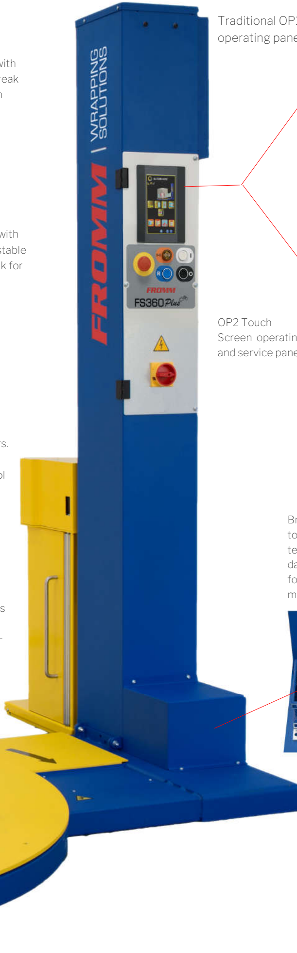
Traditional OP1 operating panel