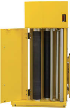
CF3, carriage with 1-motor pre-stretch, with fixed gears. 150 or 200% Tension control from OP