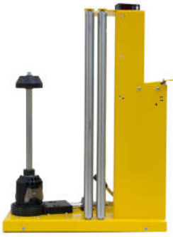
CF1, carriage with manual core break for film tension