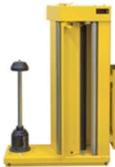
CF4, carriage with Magnetics roll brake. OP controlled pre-stretch up to 200%