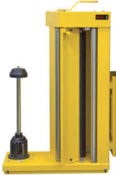
CF2, carriage with manually adjustable single roll break for film tension