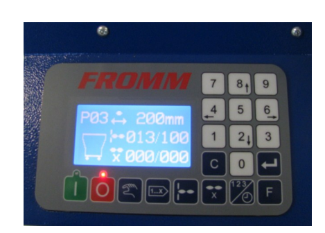
Easy to operate control panel

Fromm Packaging Systems, Inc., 85 Fulton Street, Boonton NJ 07005, 973-334-5777