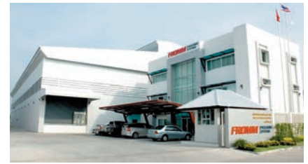
Produktionswerk für STARstrap™ Bänder in Thailand