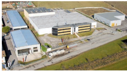
Produktionswerk für Maschinen und Geräte in Italien