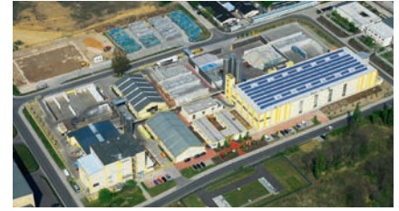
Polyester Aufbereitungswerk in Deutschland