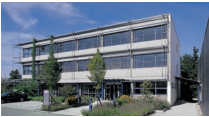
Entwicklungszentrum in Deutschland