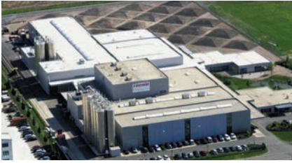
Produktionswerk für STARstrap™ Bänder in Deutschland