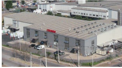
Produktionswerk für STARstrap™ Bänder in Chile