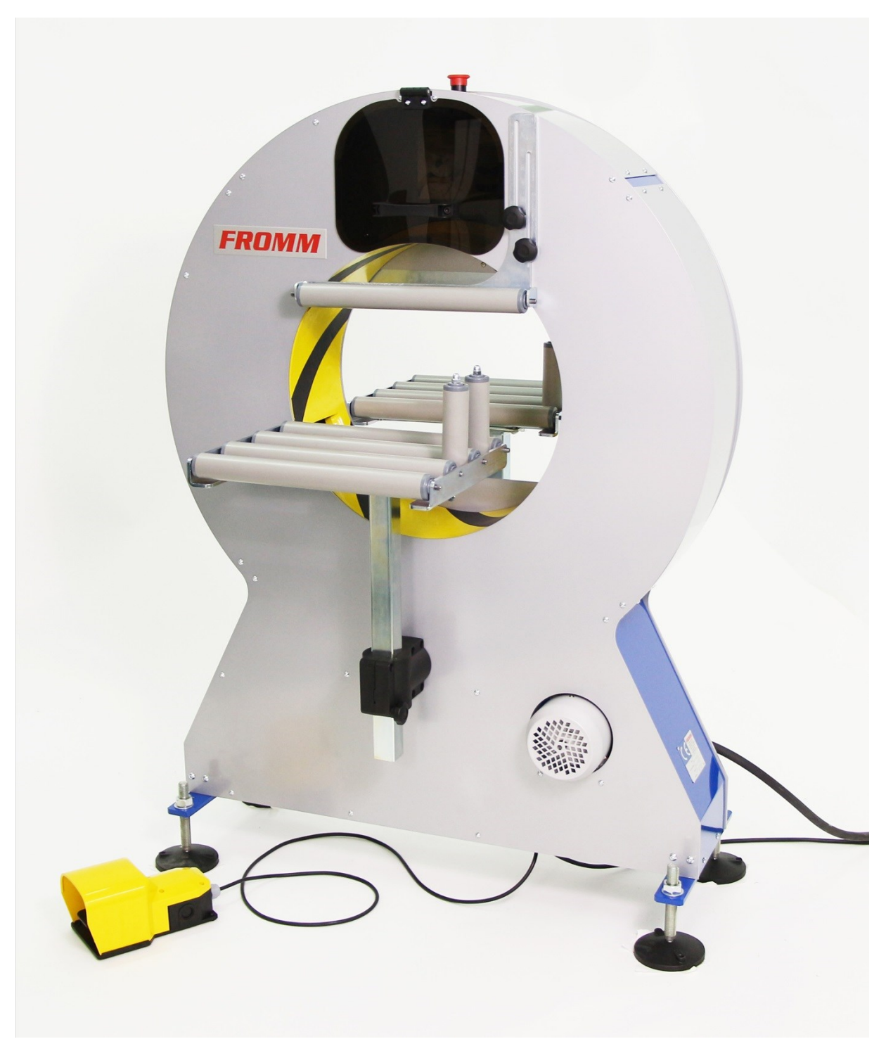
Easy packaging without limits!